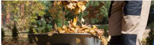
LET THE RAKING BEGIN! KANE COUNTY COMMUNITIES LEAF COLLECTION ROUNDUP 2018