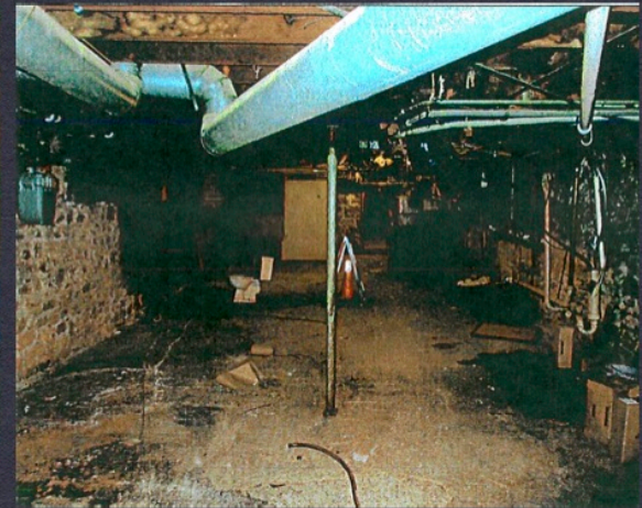
MET HALL LOFTS, 300 BLOCK EAST STATE STREET, ROCKFORD, IL