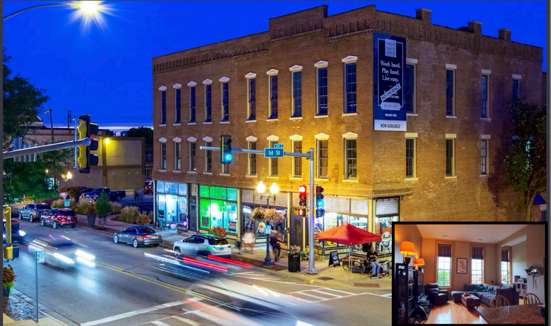
MET HALL LOFTS, 300 BLOCK EAST STATE STREET, ROCKFORD, IL